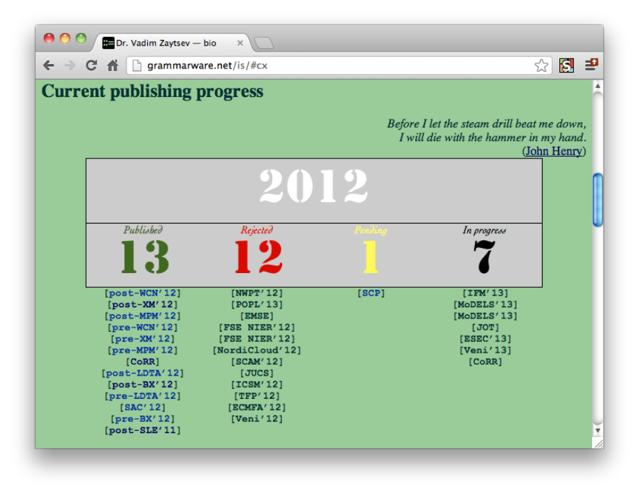
Figure 2: The results of 2012, according to the self-archiver.

figure them out, one needs to read the open notebook at http://grammarware.net/opens or analyse it automatically (no readily available tools are provided).